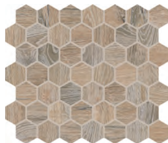
NATURAL OAK WD16