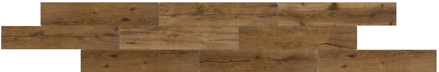
CLASSIC OAK WD17