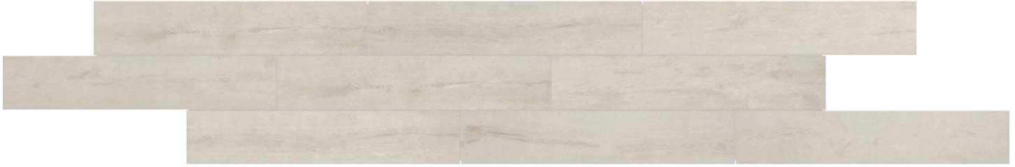
WHITE OAK WD15