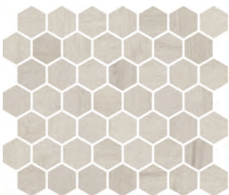
WHITE OAK WD15