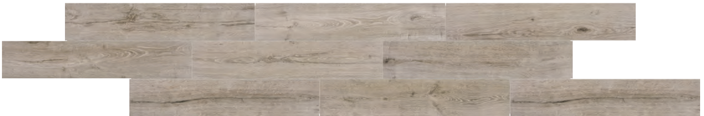
WEATHERED OAK WD18