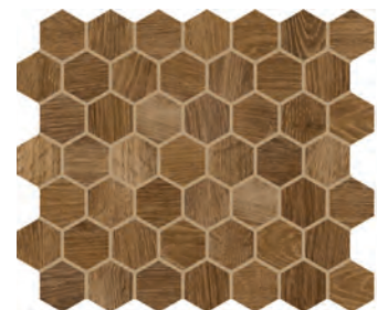
CLASSIC OAK WD17