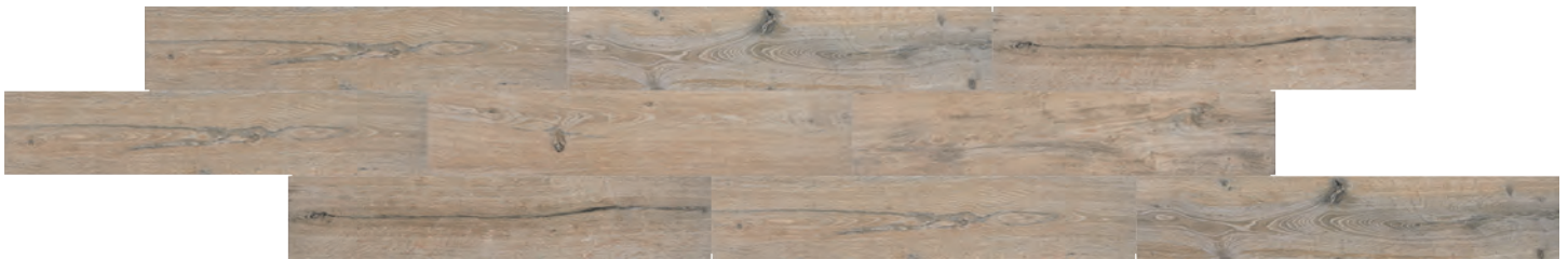
NATURAL OAK WD16