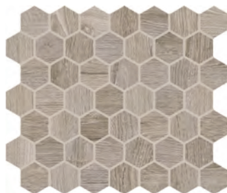
WEATHERED OAK WD18