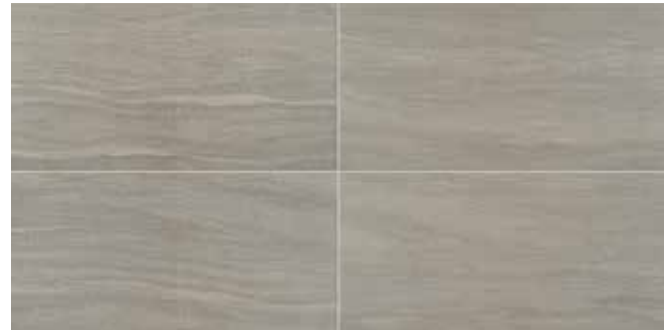
SB41 Medium Gray