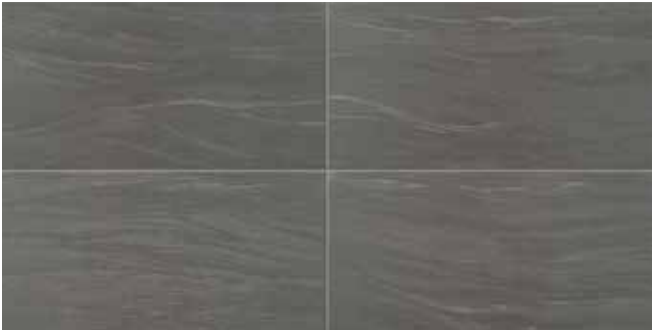
SB42 Dark Gray