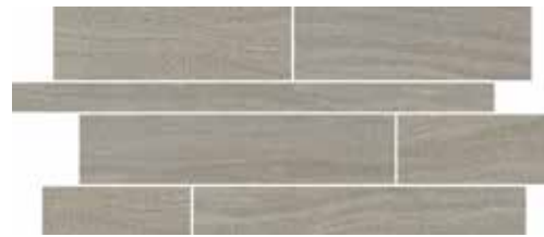
SB41 Medium Gray